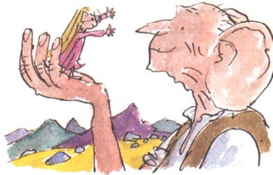
Above: The BFG at the Polka Theatre

BETH SCOTT's guide to what's on for children during November