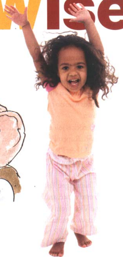
Right: dance and sing along to music at Blueberry Playsongs